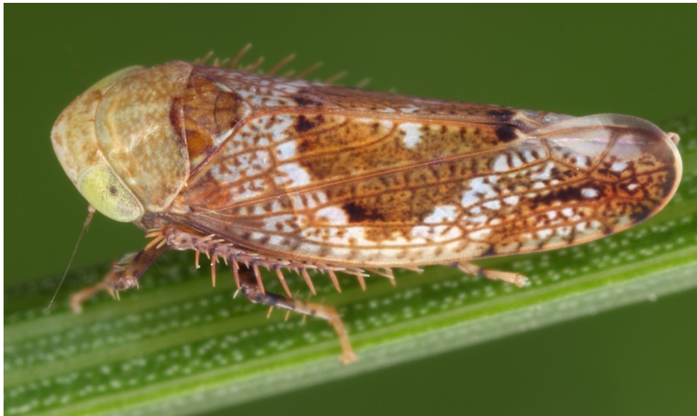
Fig. 5: The female of Hishimonus hamatus from a gardening centre in Graz.

Besides Chiasmus conspurcatus , the Auchenorrhyncha fauna of these salt marshes comprise several other very rare and threatened species. Table 1 provides a list of Auchenorrhyncha species collected at both lakes between 2012 and 2020.