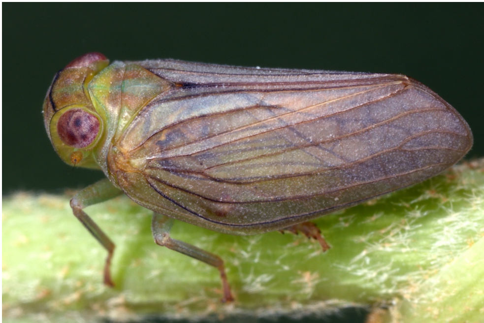
Fig. 4: The reared adult of Aplos simplex from the garden centre in Graz.