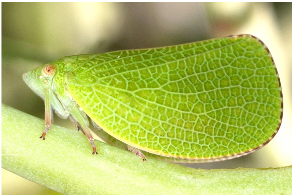
Fig. 1: Acanalonia conica on Raphanus sativus in a garden in Graz, Liebenau (Photo G. Kunz).

Styria, Leibnitz, private garden, 46°47'28"N, 15°33'22"E, 29.09.2020, 1 adult, found dead in a spider web, photo proof by Johann Brandner.