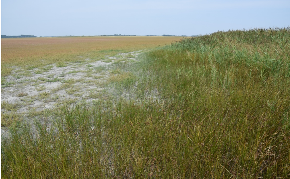
Fig. 6: Habitat of Chiasmus conspurcatus directly at the (“normal”) shoreline of the alkaline salt lake “Lange Lacke” in the Neusiedlersee-Seewinkel National Park. The lake was unusually dry in summer 2019 (Photo 28.08.2019). As vineyards and crop fields adjacent to the National Park are irrigated by ground water in a non-sustainable dimension, the – quite sensitive – water balance of the lakes is already seriously damaged, and this effect will be boosted by climate warming in future.