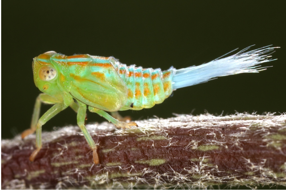
Fig. 3: The nymph of Aplos simplex found in a gardening centre in Graz.