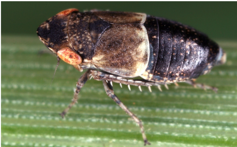
Fig. 7: Brachypterous individuuum of Chiasmus conspurcatus.