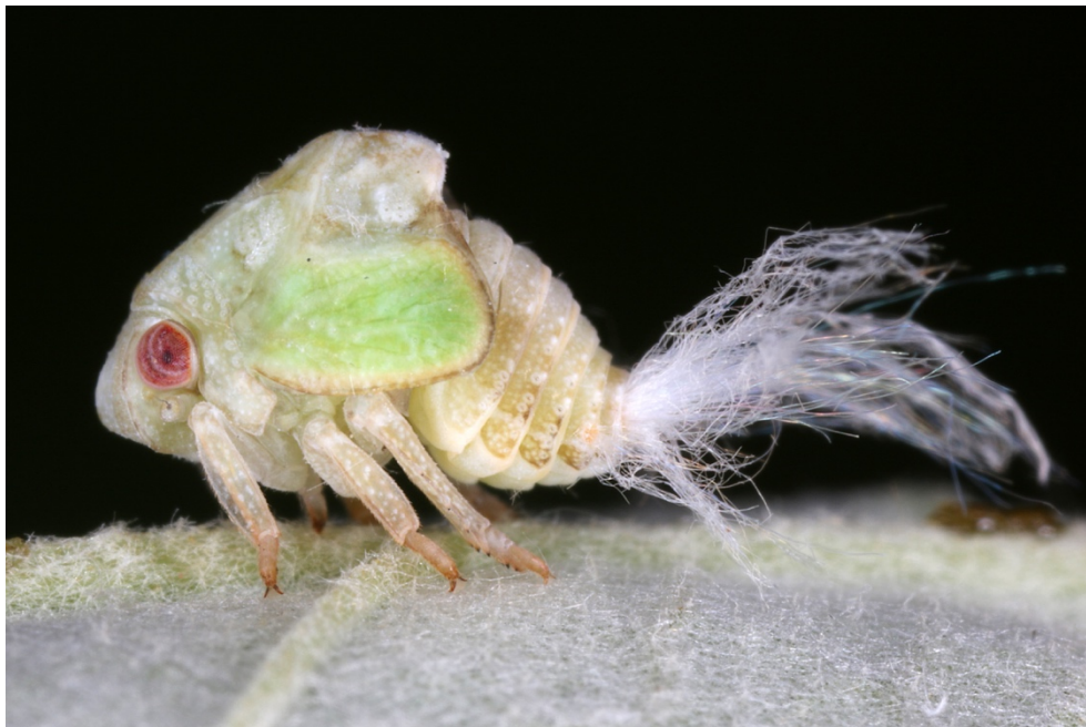
Fig. 2: Nymph of Acanalonia conica from Austria.

According to David Stan, employee of the gardening centre in Graz, Acanalonia conica is present at this place already for several years. Due to several recent findings in Styria, it is likely that the species is already established in southern Austria.